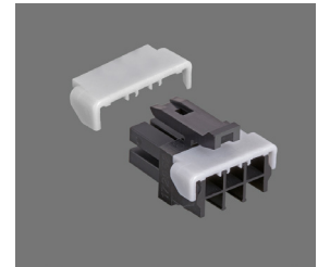
Micro-Fit* TPA Dual-Row Receptacle