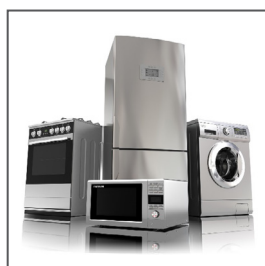
Home Appliance (White Goods)